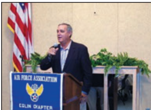
US Rep. Jeff Miller (R-Fla.) addresses the Eglin Professional Consortium, led by the Eglin Chapter.