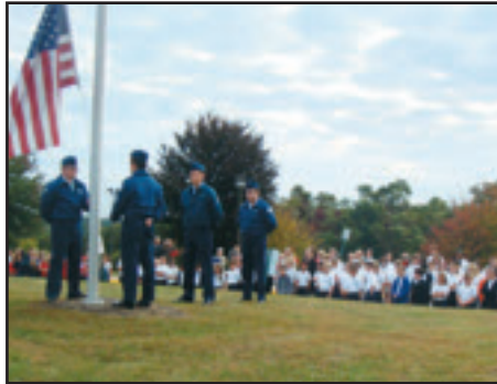
In Virginia, the Northern Shenandoah Valley Chapter arranged for a demonstration of US flag protocol to students at Sacred Heart Academy in Winchester. The honor guard performing the flag ceremony came from nearby Randolph-Macon Academy.