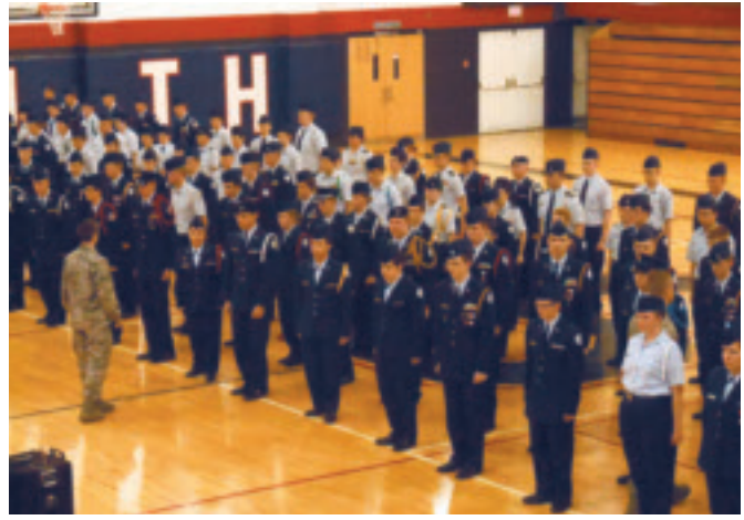
Cadets from seven high schools compete in the knockout drill category at the Chuck Yeager Chapter's Air Force JROTC drill meet in West Virginia.