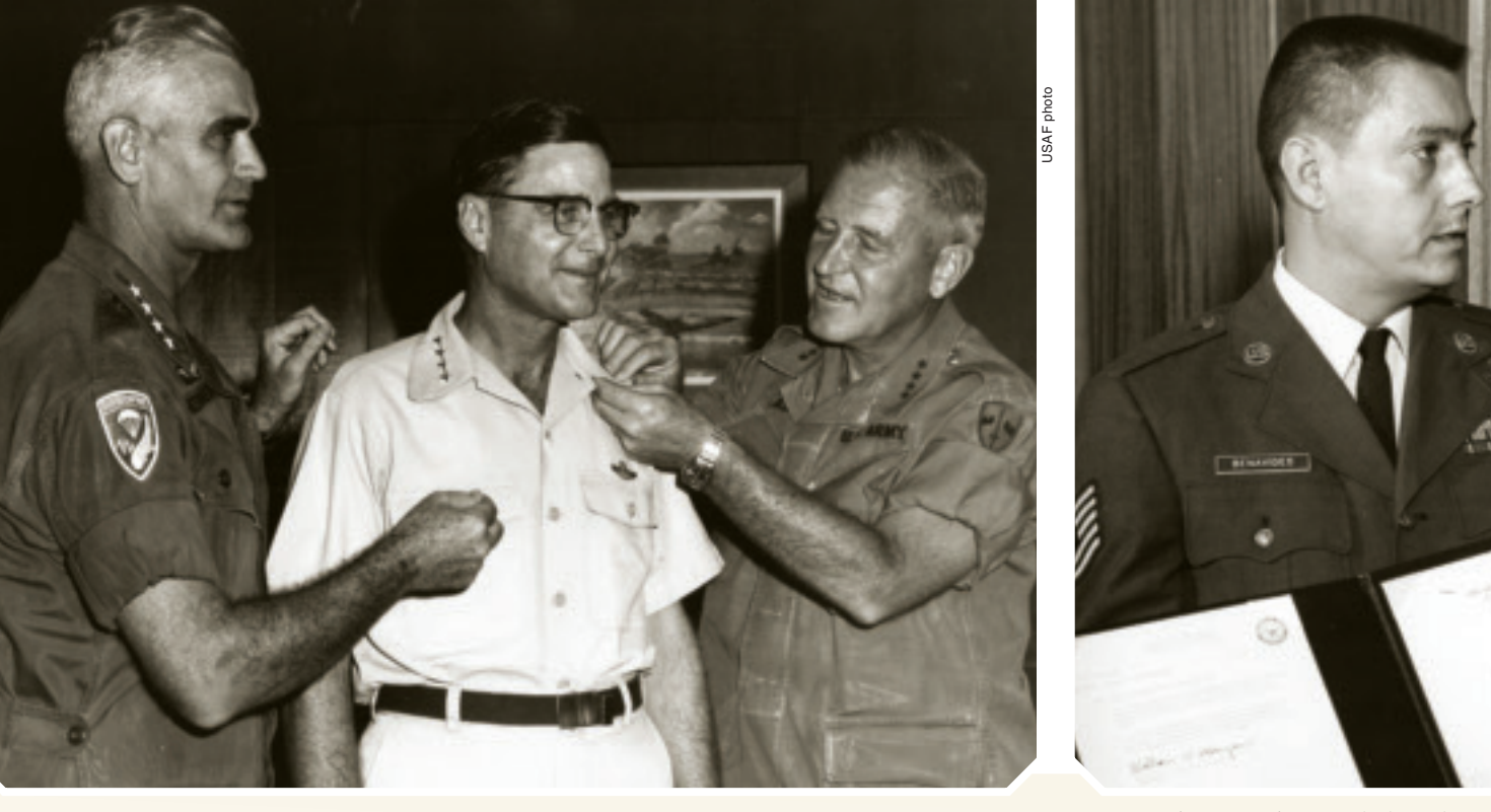
Gen. William Westmoreland (I) and Gen. Creighton Abrams (r) pin on Momyer's fourth star in Saigon in 1967. Although denied centralized control of air assets in Vietnam, Momyer made sure airpower was used to the maximum allowable effectiveness.

gear. He crawled out of the cockpit and ran to the destroyer USS Dallas , already tied up at the pier, requesting that a message be sent to Chenango to cancel any further launches.