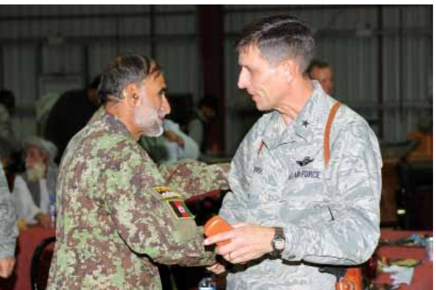
USAF Brig. Gen. Paul Johnson greets Afghanistan Air Force Brig. Gen. Mohammed Yousef at Kandahar Airfield, Afghanistan, in September 2010. Johnson is now commander of the 451st Air Expeditionary Wing at Kandahar.

and black smoke pouring out of it, and the [rescue helicopter] comes in and lands. Then, just 100 yards away from the burning truck, this guy jumps up out of his hole and runs to the helo."