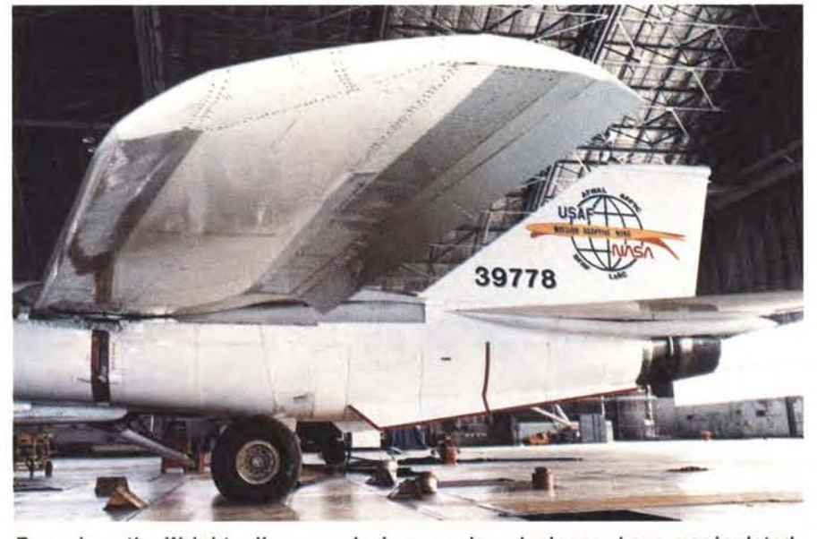
Ever since the Wrights discovered wing-warping, designers have manipulated the size and shape of wings for better performance, from the Berliner-Joyce XO-J1 with its "zap flaps" (top) to the Boeing-NASA-USAF F-111 with mission adaptive wing (above).