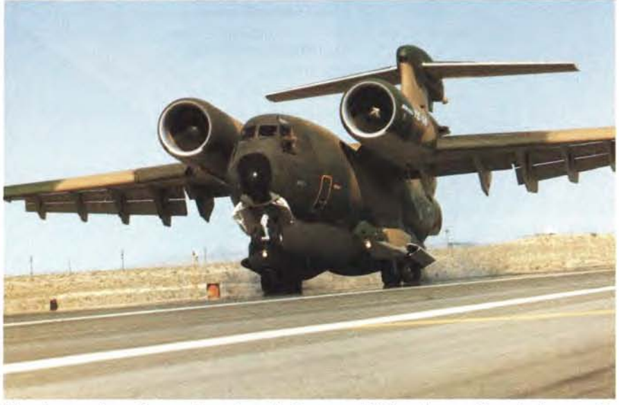
Blowing engine air over the wings to increase lift has been attempted several times over the years in such aircraft as the Custer Channel Wing (top) and the Boeing YC-14 (above), whose competitor, McDonnell Douglas's YC-15, is an ancestor of USAF's C-17 Globemaster III.

25, 1946. As many as 200 B-35s were on order at one time, but changing requirements and a lack of stability during the bomb run brought about cancellations and controversy.