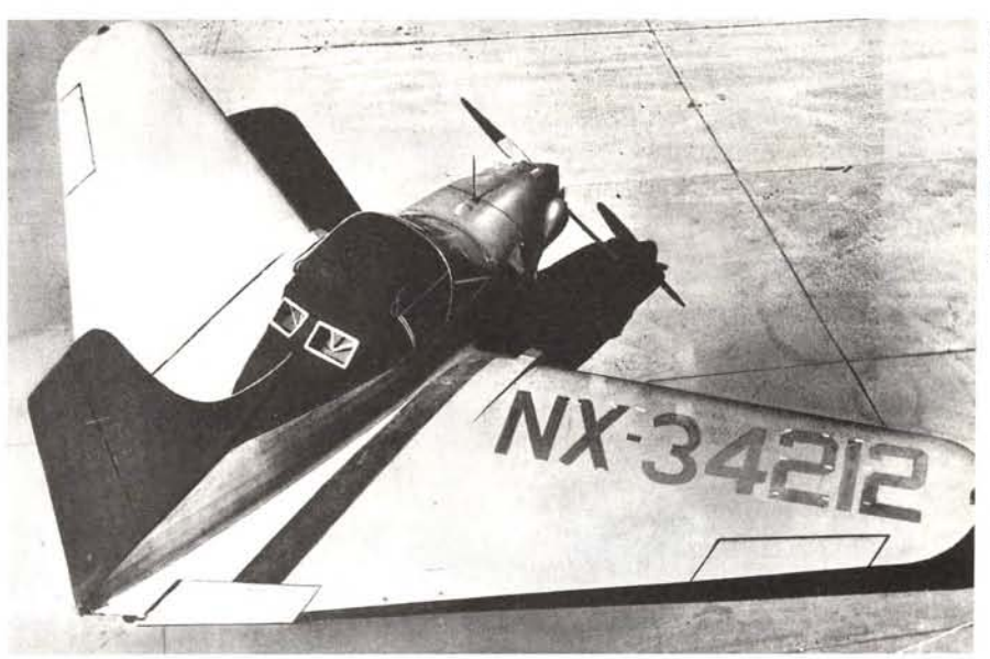
George Cornelius's 1930s-vintage "Mallard" (above) combined forward-swept wings with variable incidence. Grumman's highly successful X-29 technology demonstrator (top) had forward-swept wings whose trailing edges changed shape continuously to match flight conditions.

The design concept went through a long series of permutations by a wide range of manufacturers, including Blériot, Granville Brothers, Westland Aircraft Works, and Focke-Wulf, but achieved its greatest success in the variations of Burt Rutan's sleek composite Long-EZ design.