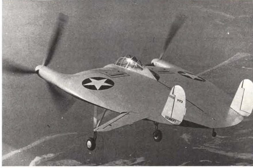
Aircraft designers sometimes use the same approach to solve different problems. The Vought V-173 "Flying Pancake" (above) owes its low-aspectratio design to a quest for reduced drag, while Lockheed Martin's F-117 (top) takes a similar shape in order to reduce radar signature.

The low aspect ratio found in the Lockheed Martin F-117 Nighthawk stealth fighter or the older Convair F-102 Delta Dagger and F-106 Delta Dart interceptors was anticipated by many aircraft, beginning with