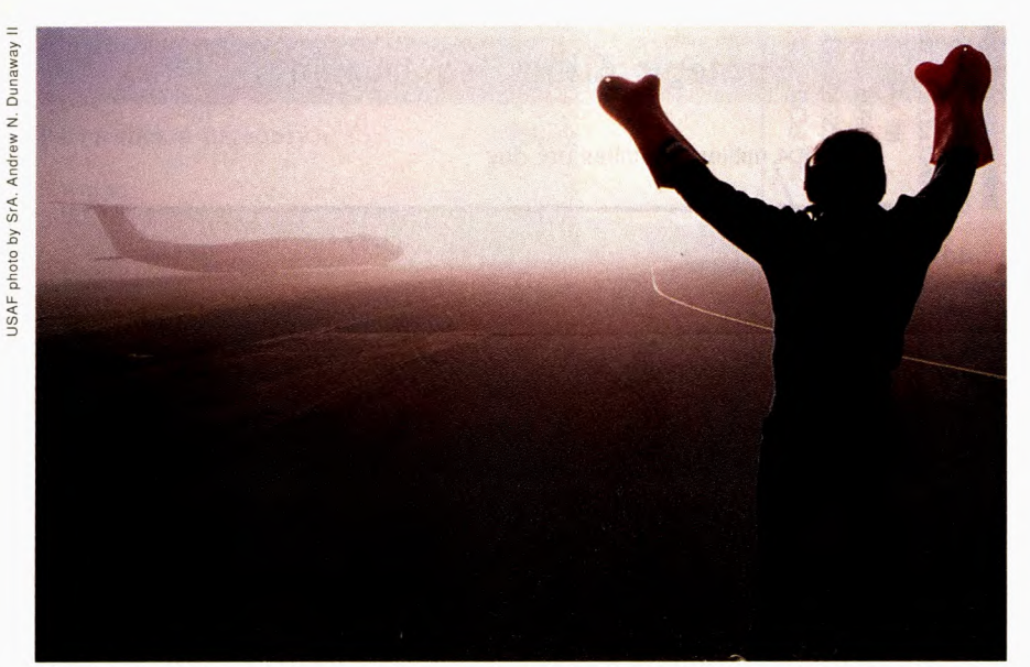
Finding a replacement for the C-141 took on added urgency when parts of the Starlifter fleet were grounded for age-related maladies. After studying the options from numerous angles, USAF decided that the C-17 was its best bet.