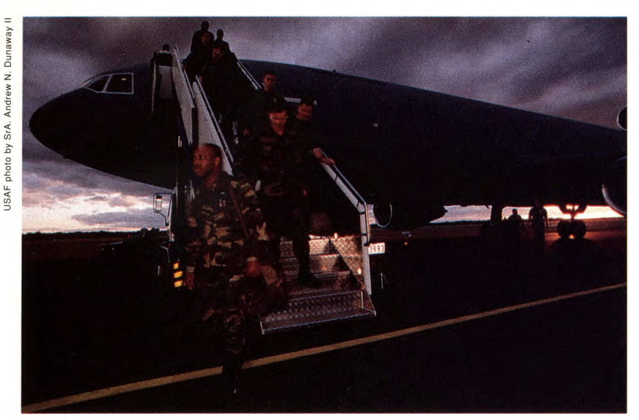
The C-17 still must receive an OK from Congress, which may continue to push for a C-17/NDAA mix. Meanwhile, USAF appears to be set with its tanker fleet, with KC-10s (above) and KC-135s soldiering on until 2020 and beyond.

General Fogleman explained, "and that gives you some options in the outyears to look at . . . whether you need more of them, or whether you start to use this basic airframe for other things."