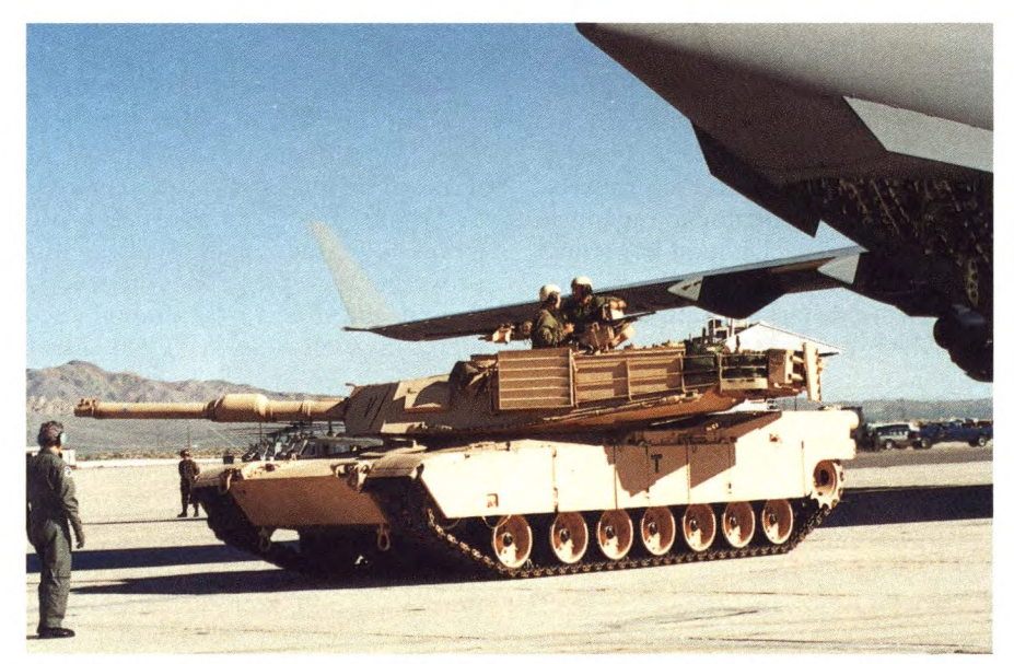
The C-17's ability to carry such outsize cargo as this M1A2 Abrams tank gave it the edge over the C-33, which also lacked roll-on/roll-off capability and could not operate on short or austere fields.

The decision does not have to be made soon, but clearly Air Force officials are not ruling out such a move. "The primary advantage of building them at eight per year is you keep it in production longer,"