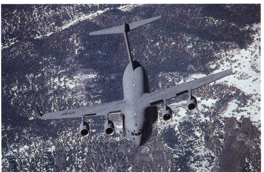
A rigorous reliability, maintainability, and availability evaluation last summer showed that the C-17's growing pains are a thing of the past. It succeeded despite being judged by standards usually applied to mature weapon systems.

For the company, this was a turning point. The omnibus agreement was "a major part of the turnaround," said McDonnell Douglas Vice Presi-