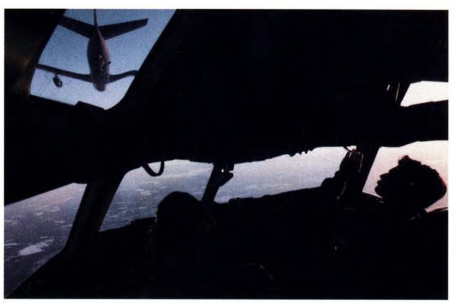
The deploying RED HORSE personnel and their equipment arrived mostly in C-130s, C-141s, and C-17s (above, refueling from a KC-135). An in-demand asset, RED HORSE engineers have recently spent up to 280 days per year traveling.

RED HORSE units were first established during the Vietnam War. They built their first facilities at Bien Hoa AB, South Vietnam. During the Persian Gulf War, the 823d RED