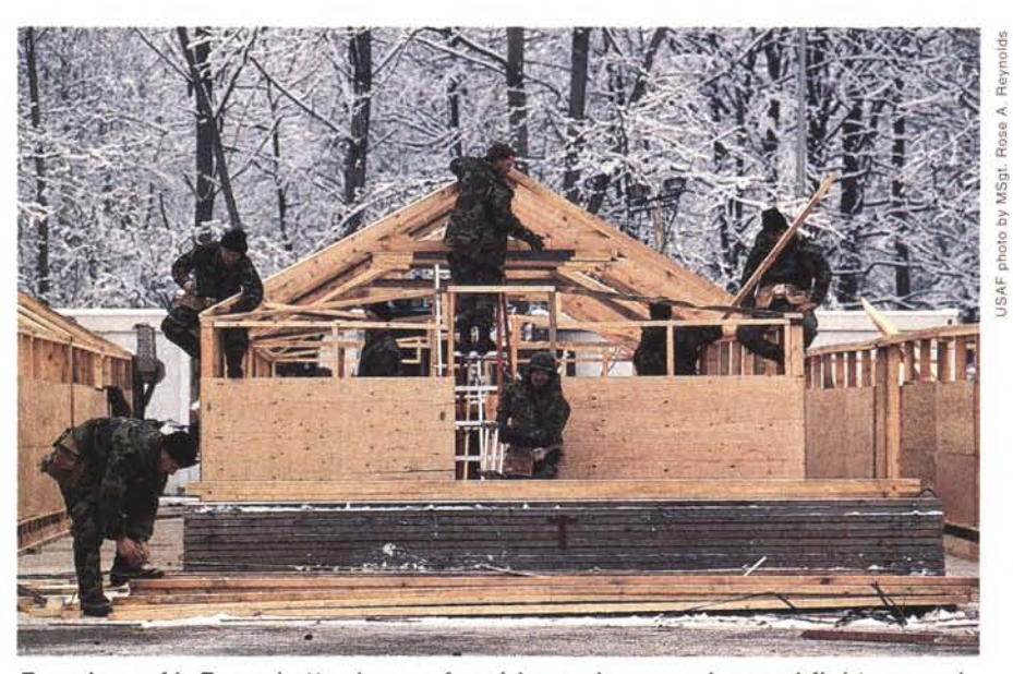
Even in an Air Force better known for airborne lasers, advanced fighters, and satellites, there is still a place for hammers, nails, and elbow grease. RED HORSE personnel arrived early in Bosnia-Hercegovina and worked around the clock to make sure that arriving troops would have a dry, warm place to sleep.

Operation Joint Endeavor, the brutal Balkan winter featured not only breathtaking cold but also alternating periods of rain, snow, and ice. At times, an ocean of mud encased Tuzla, which has served as the logistic hub for Task Force Eagle, the name used by the US-led multinational force comprising the US Army's 1st Armored Division and units made up of Turkish, Scandinavian, Baltic, and Russian troops.