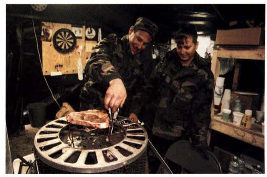
Thanks to a donation from a grocery chain back in the States, more than 100 of the troops in the Balkans were able to enjoy a steak dinner—a real boost to morale for Army and Air Force personnel serving thousands of miles from home.

The idea is to rotate soldiers through the facilities for rest and recreation. These tents are heated better than those in the field, and recreation facilities include basketball courts,