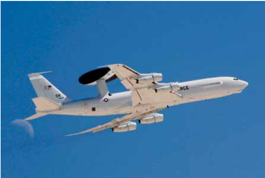
An E-3 Sentry AWACS aircraft takes off from Nellis Air Force Base, Nev.

Purpose: C2 is the Core Function primarily responsible for providing Decision Superiority to the global force. In order to achieve decision superiority, Airmen employ C2 capabilities through robust, adaptable, and survivable C2 systems. These systems rely on access to reliable and trustworthy communications and information networks across a range of joint military operations and environments.