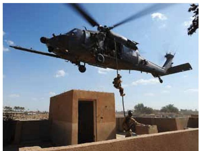
A pararescueman fast ropes from an HH-60 Pave Hawk helicopter.