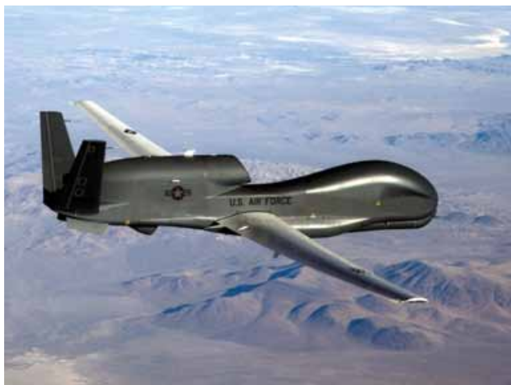
RQ-4 Global Hawk

Purpose: GIISR is the Core Function primarily responsible for providing Decision Advantage and Precision Attack to the Joint Force. To do this, GIISR must possess capabilities to effectively access targets of interest, define targets and their location in time and space in relation to adversary threats, and characterize the battlespace. The GIISR enterprise conducts operations to validate knowledge, test theories, and discover unknowns in order to enhance warfighter readiness, and combat systems, and support future weapons system development. In this regard, GIISR enhances airpower kill-chains and is essential to Global Power.