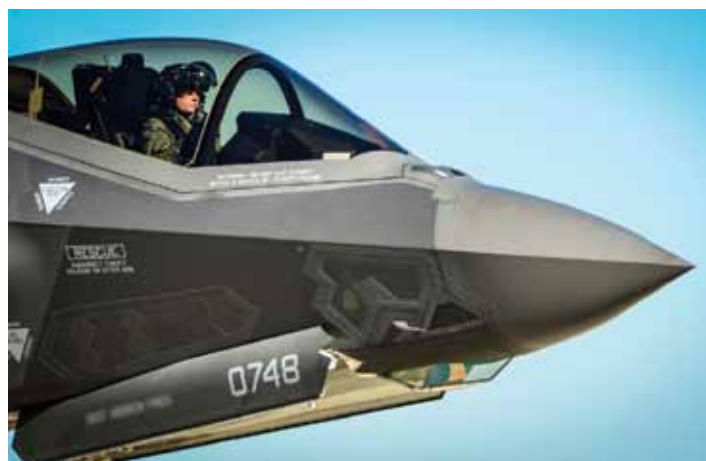
F-35 Lightning II

To fight and win in today's and in future conflicts, especially in contested environments, we must team with our Joint, Allied, and Coalition partners to tackle our collective challenges. We cannot overcome times of global fiscal constraint by retreating into an Air Force centric worldview. We cannot and will not become a parochial force. ACC takes their obligations to America's Soldiers, Sailors, and Marines seriously, and we must continue to strengthen the collaborative efforts within our Service and beyond. We must cultivate stronger partnerships with our Joint, Allied, and Coalition teams to capitalize on the synergy created by our combined resources in providing timely, comprehensive, and appropriately scaled combat airpower. These are not just materiel solutions, but solutions involving doctrine, organization, training, planning, resourcing, and requirements. We are getting smaller—partnering for greater combat capability can and will help.