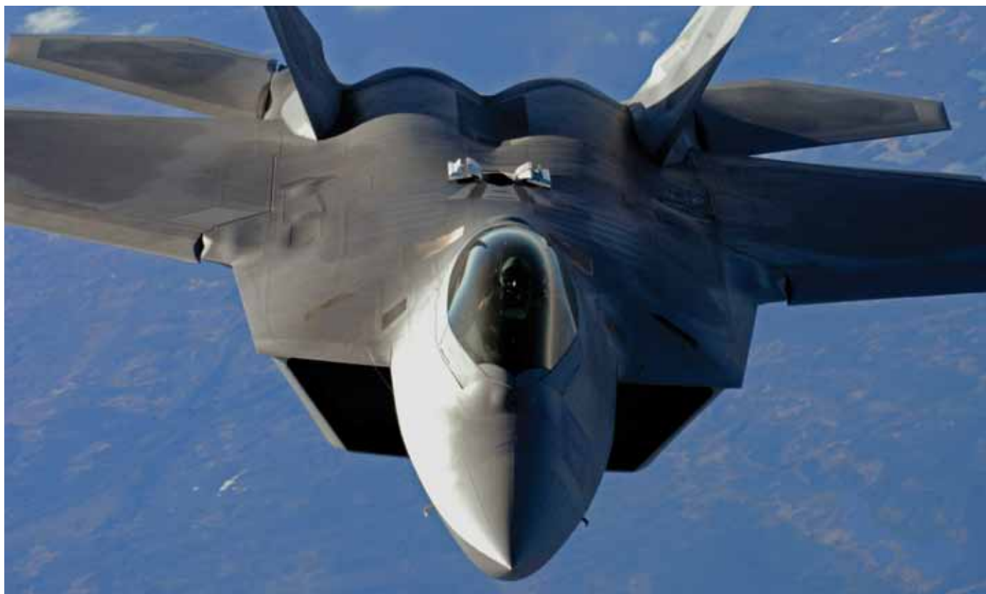
An F-22 Raptor receiving fuel from a KC-135 Stratotanker.

Securing the High Ground articulates the guiding principles and foundational ideas for providing America with dominant combat airpower. Within the context of the current strategic and fiscal environments, these principles guide the transformation of today's Air Force into the Air Force of tomorrow. There are two main lines of effort in this document to achieve this objective: