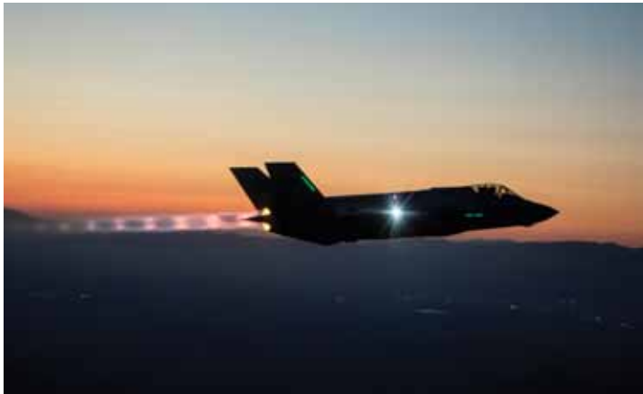
An F-35 Lightning II performs a night flight.

Purpose: GPA is the Core Function primarily responsible for providing Global Power to the Joint Force. We accomplish this function by ensuring we have the ability to hold targets at risk and strike rapidly and persistently with a wide range of munitions to create swift, decisive, and precise effects across multiple domains.